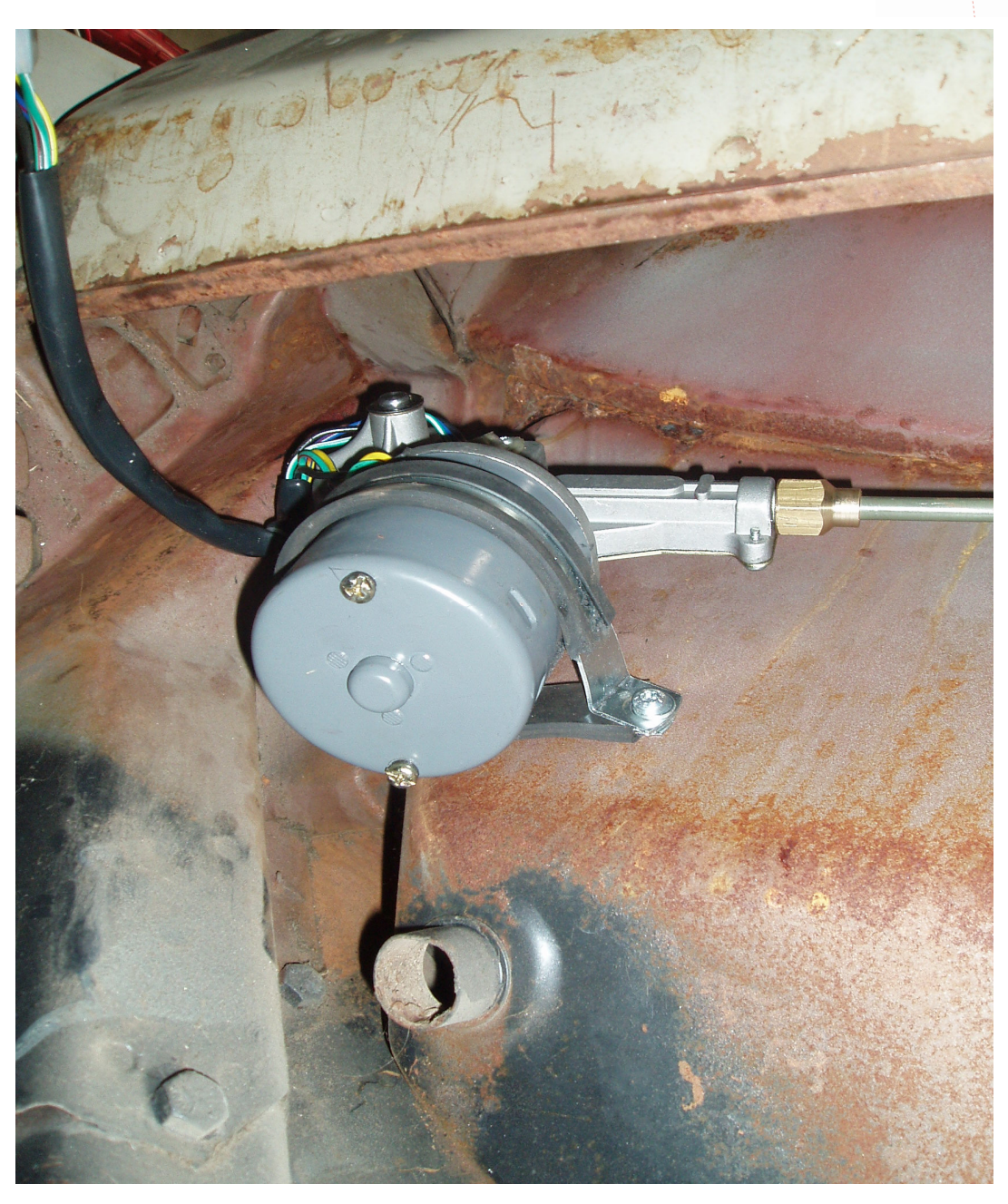
Motor mounts left side under dash.